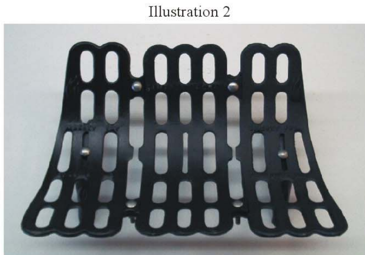
ASSEMBLED GRATE (G500-24 shown)