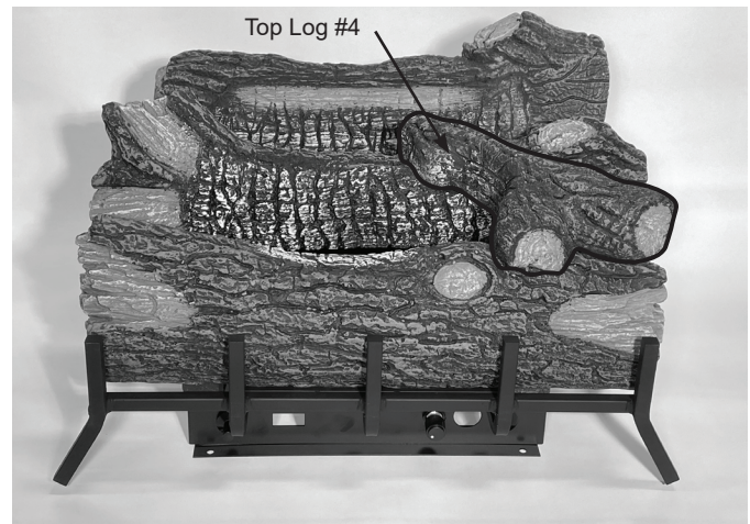
Figure 4 - Place Top Log