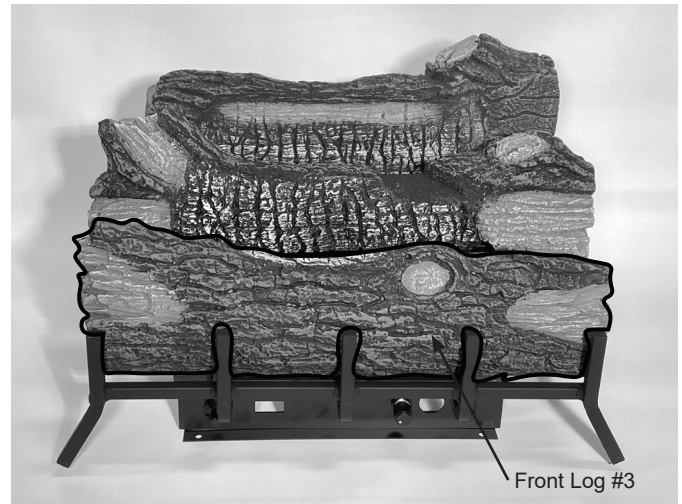
Figure 3 - Place Front Log